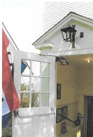
The Thrifty Niche is closed till further notice.